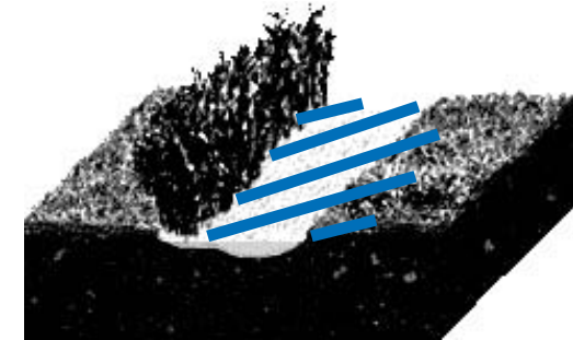
Flooding with wetlands

The students' diagrams will be approximate; what is important is that the flooding is much less severe for the region with wetlands